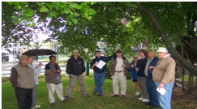
(first meeting for our new president at Lions picnic)